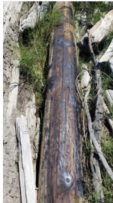
A large creosote log found in Livingston Bay, Port Susan. Notice the shiny, tar-like creosote on the surface of the log.

Creosote is a toxic chemical mixture used as a wood preservative. The chemical cocktail that makes up creosote contains many toxic components, including known carcinogens. Creosote has a tar-like appearance, with a unique, smoky smell, similar to freshly laid asphalt.