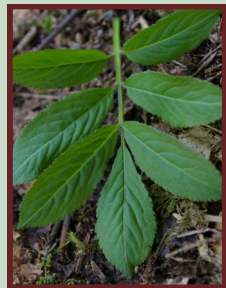
5-7 leaflets sharply toothed