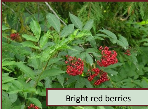
Bright red berries